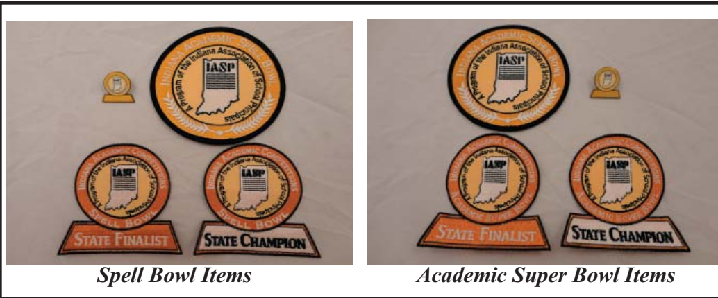
Spell Bowl Items

Academician Medal (right) is a 1.25" round bronze medallion with raised lettering and logo, suspended from red, white & blue drape.